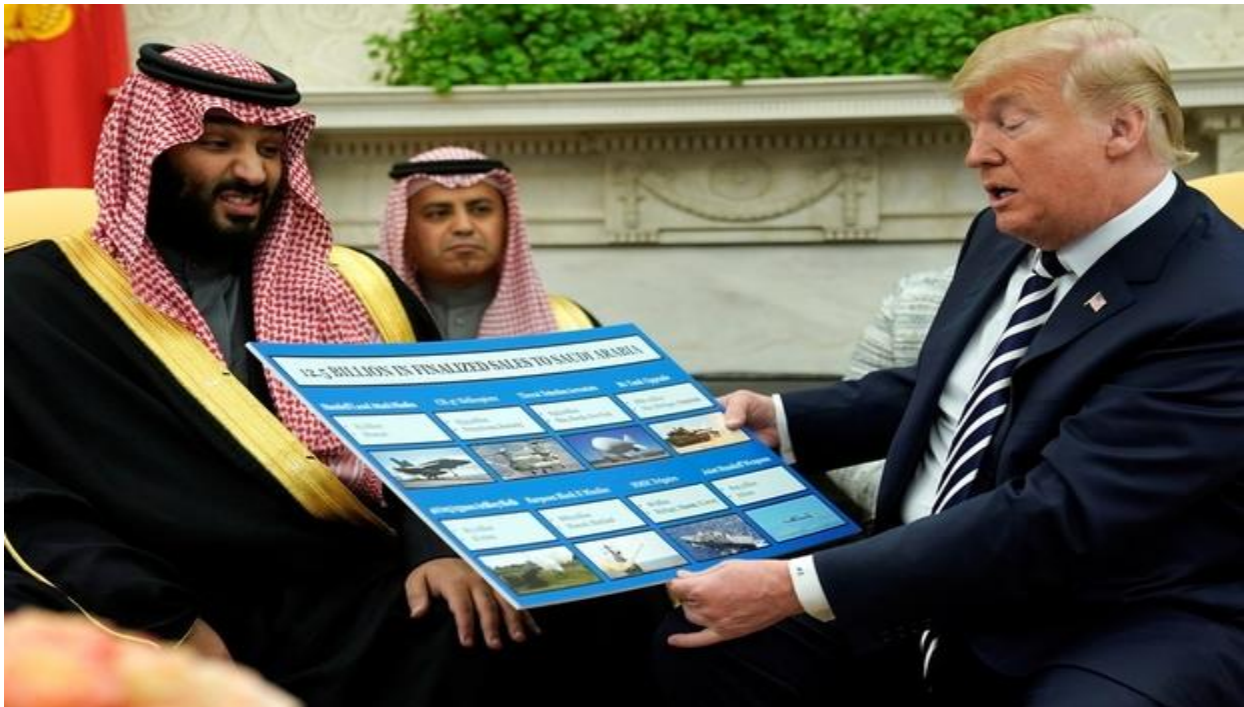
Trump holding a chart of weapon sales with Mohammed bin Salman in the Oval Office

Trump visited Saudi Arabia on his first foreign trip as president and returned to Washington boasting about $110bn secured in weapon deals.